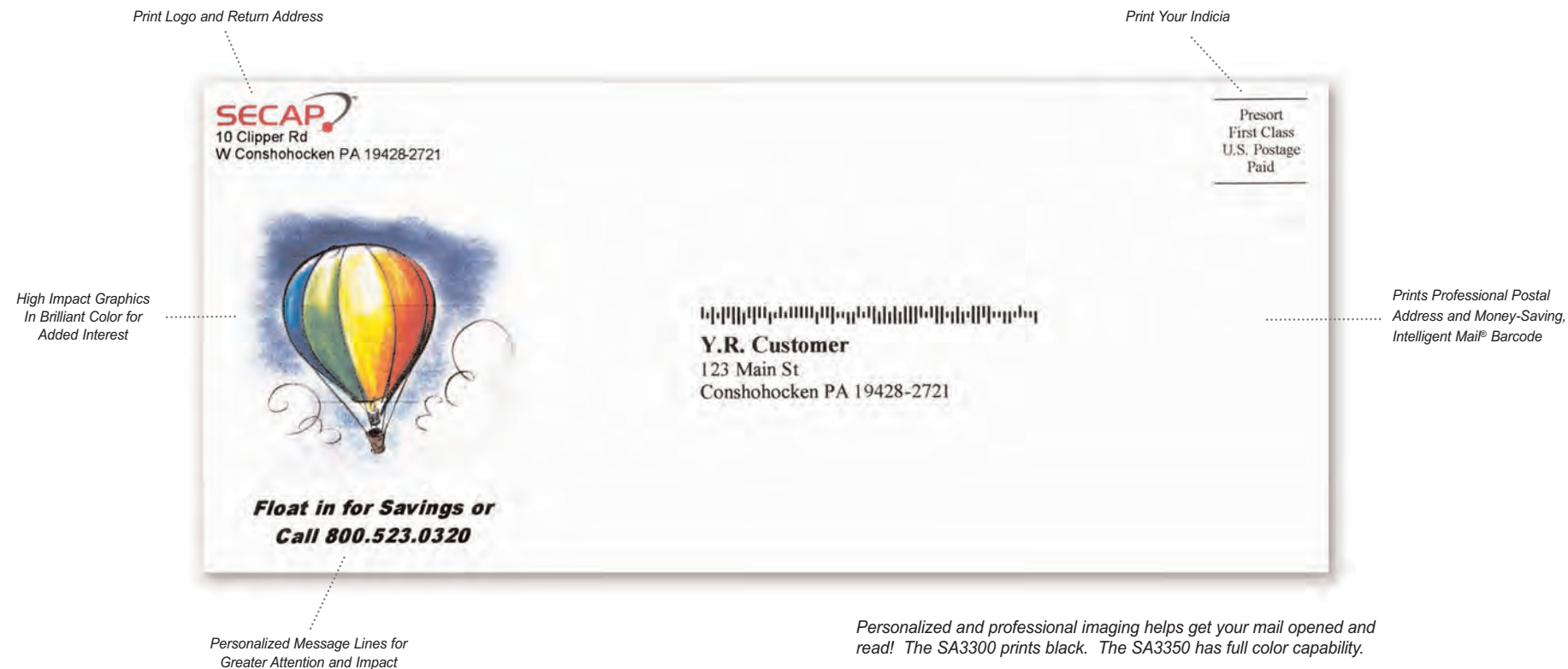
Personalized and professional imaging helps get your mail opened and read! The SA3300 prints black. The SA3350 has full color capability.

The SA3300 and SA3350 utilize shuttling head technology that provides the flexibility to customize your outgoing mail and maximize your messaging.