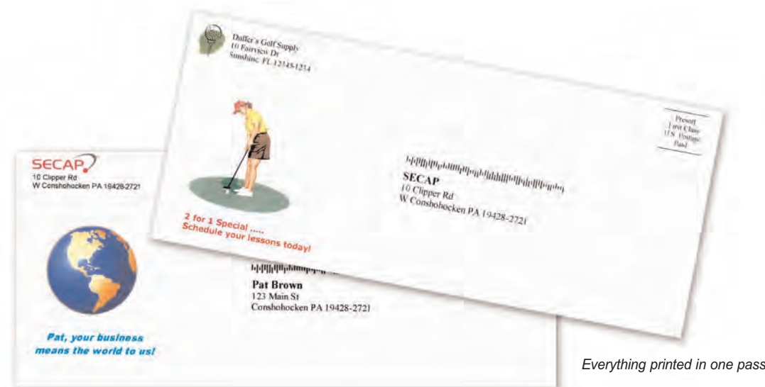
Everything printed in one pass.

Personalizing and using color on your outgoing mail just got faster and easier. With the SA3350, you can do both, making a good thing even better. Print in brilliant full color for eye-catching appeal that gets attention and makes your piece stand out in a heap of mail! Use color in your logo and graphics. Personalize using your customer's name for greater impact and effectiveness. Best of all, do all this in one pass for maximum productivity!