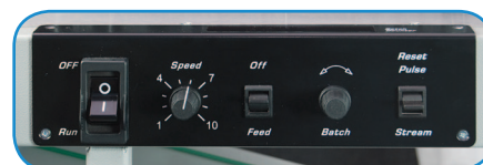
Easy-to-use control panel

* Speed varies depending on paper weight