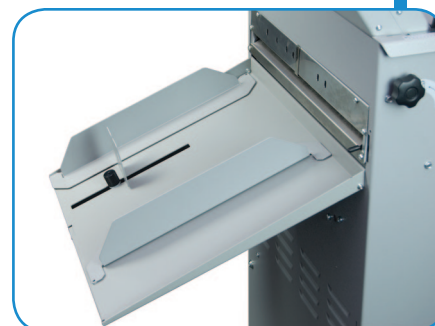
Perforation / score attachment, included

Formax - New Hampshire, USA www.formax.com