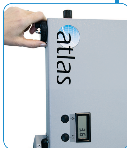
Fold adjustment knob and LCD readout