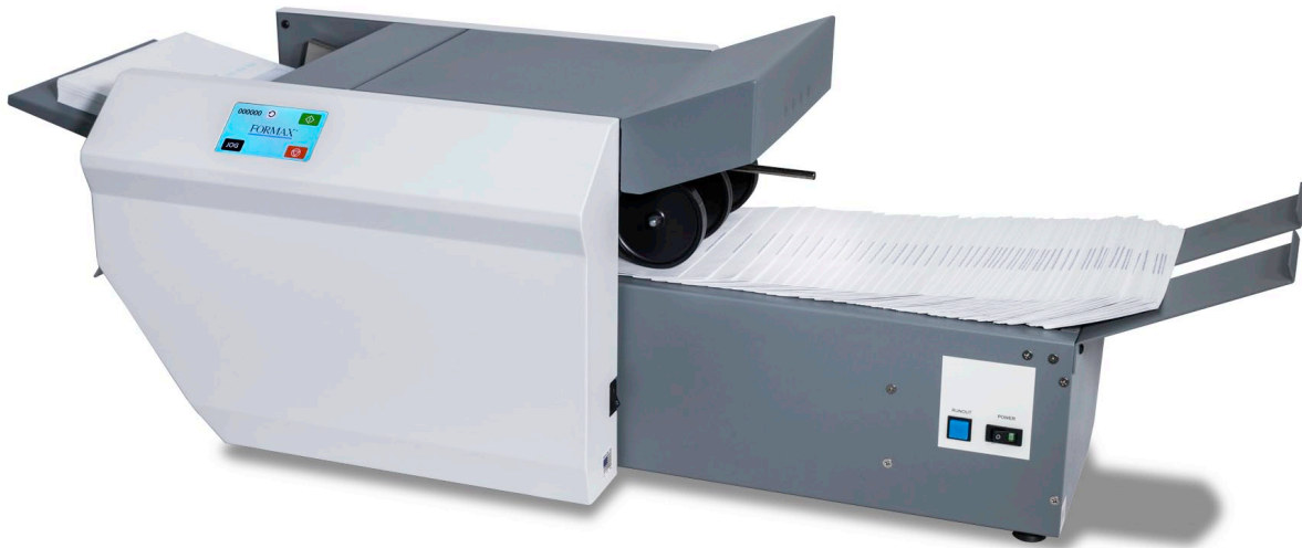
FD 2036 shown with optional conveyor

The FD 2036 AutoSeal® is a user-friendly high-volume solution for processing one-piece pressure sensitive mailers. The color touchscreen control panel uses internationally-recognized symbols in place of text, and includes a six-digit resettable counter. With a speed of up to 11,000 forms per hour, hopper capacity of up to 350 forms, and the ability to process forms up to 14" in length, the FD 2036 enables operators to complete daily processing jobs with ease.