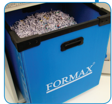
Lifetime Guaranteed Heavy-Duty Waste Bin