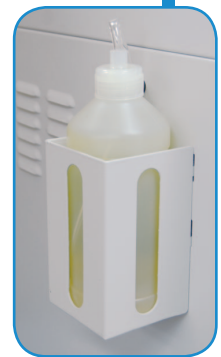
Optional EvenFlow™ Automatic Oiling System

Formax – New Hampshire, USA www.formax.com